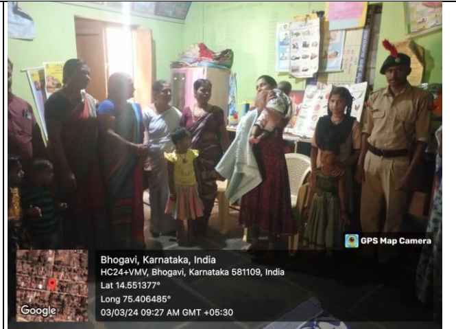
1 st Year NCC (SD) Cadet. Location- Bhogavi