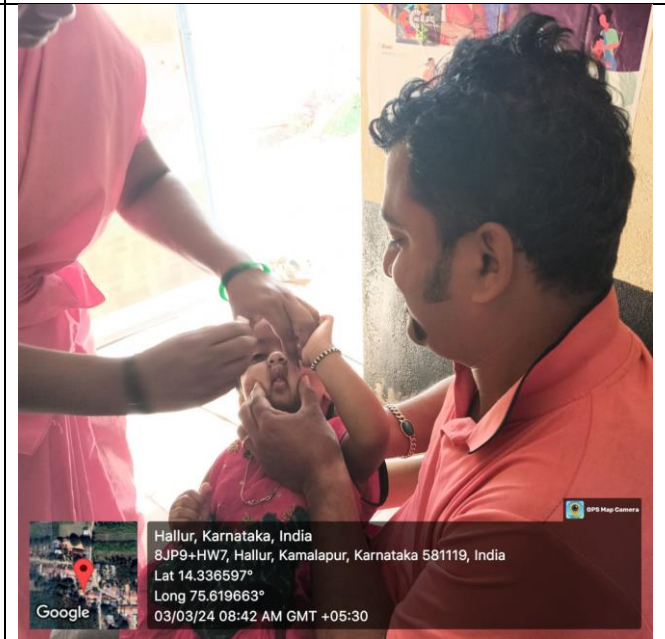
Location: Halluru (NCC - Alumni)