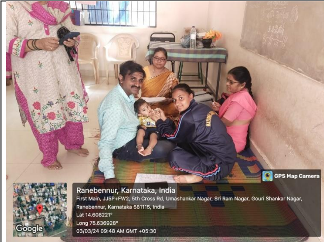
1 st Year NCC (SW) Cadet. Location- Ranebennur