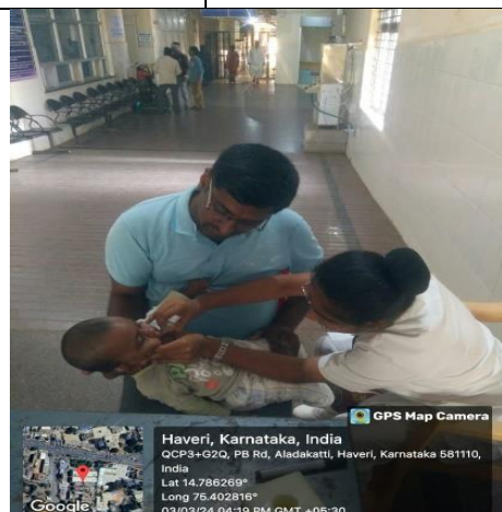
Location : Haveri