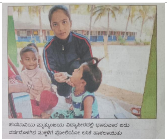
Daily News Paper: Prajavani. Page No: 3. Dated: 04-March-2024